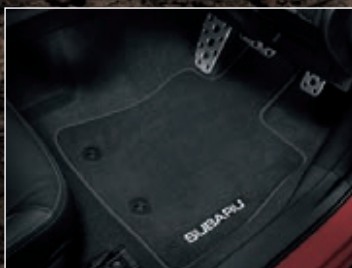
CARPET MAT SET