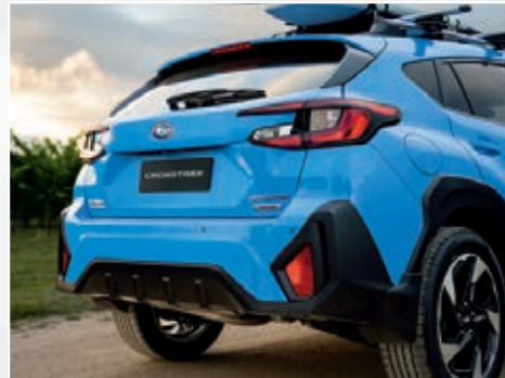
Subaru Crosstrek AWD Hybrid S