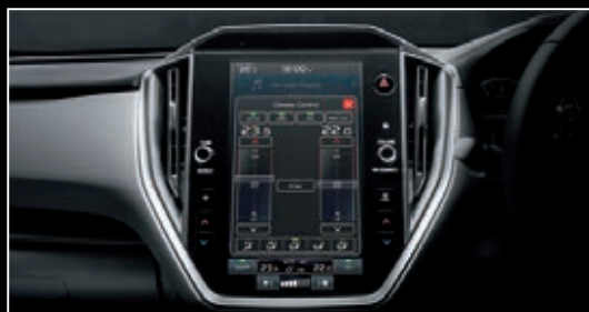
Subaru Crosstrek AWD 2.0S

A cabin intuitive to the rhythm of your drive starts with the new centre information display that features a tablet-like 11.6" touchscreen with quick response touch and crystal clear high definition graphics coupled with wireless Apple CarPlay® and Android Auto™ smartphone connectivity 1 as standard. The sleek modernist cabin keeps you in tune with your contacts, podcasts and favourite apps, digital radio 2 (DAB+) streams crisp, clear sound, while Bluetooth ® 3 wireless technology, and handy USB-A and USB-C connection keeps everyone fired up.