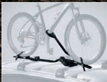
BIKE HOLDER - BLACK (PRORIDE)