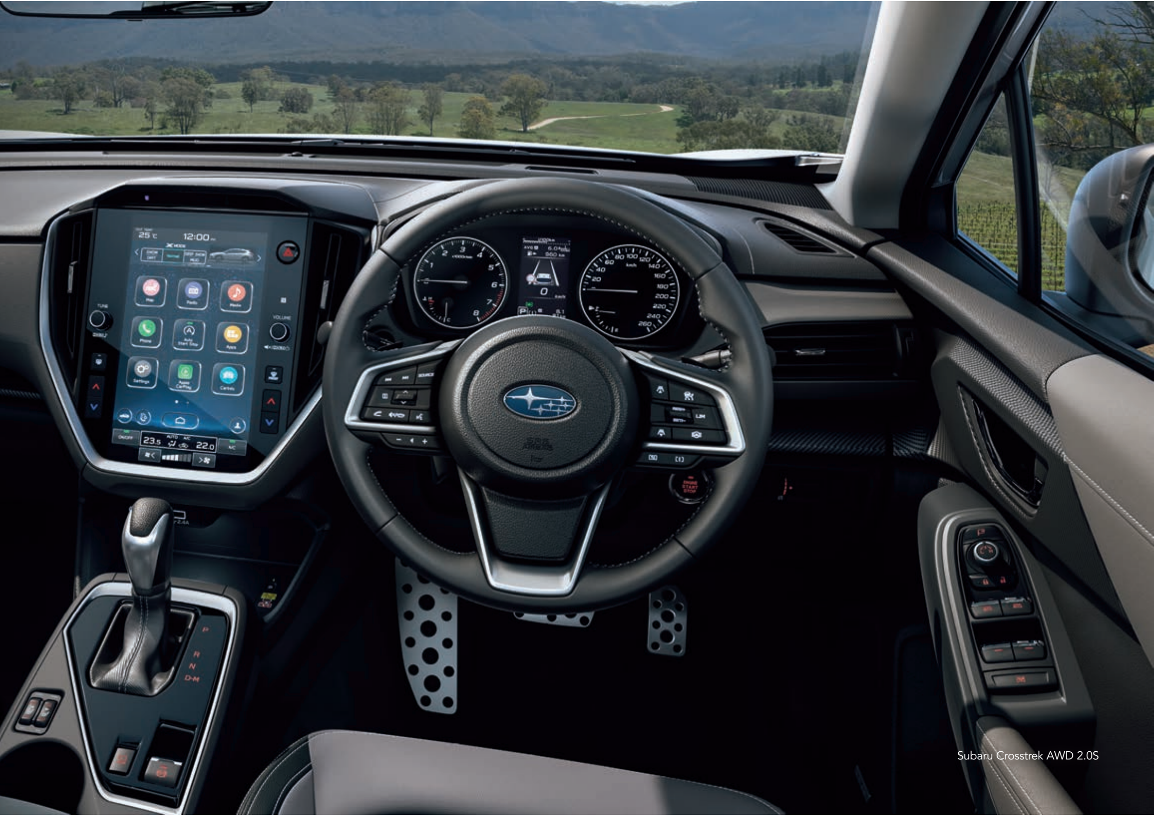
Subaru Crosstrek AWD 2.0S