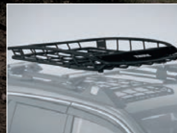
THULE ROOF BASKET