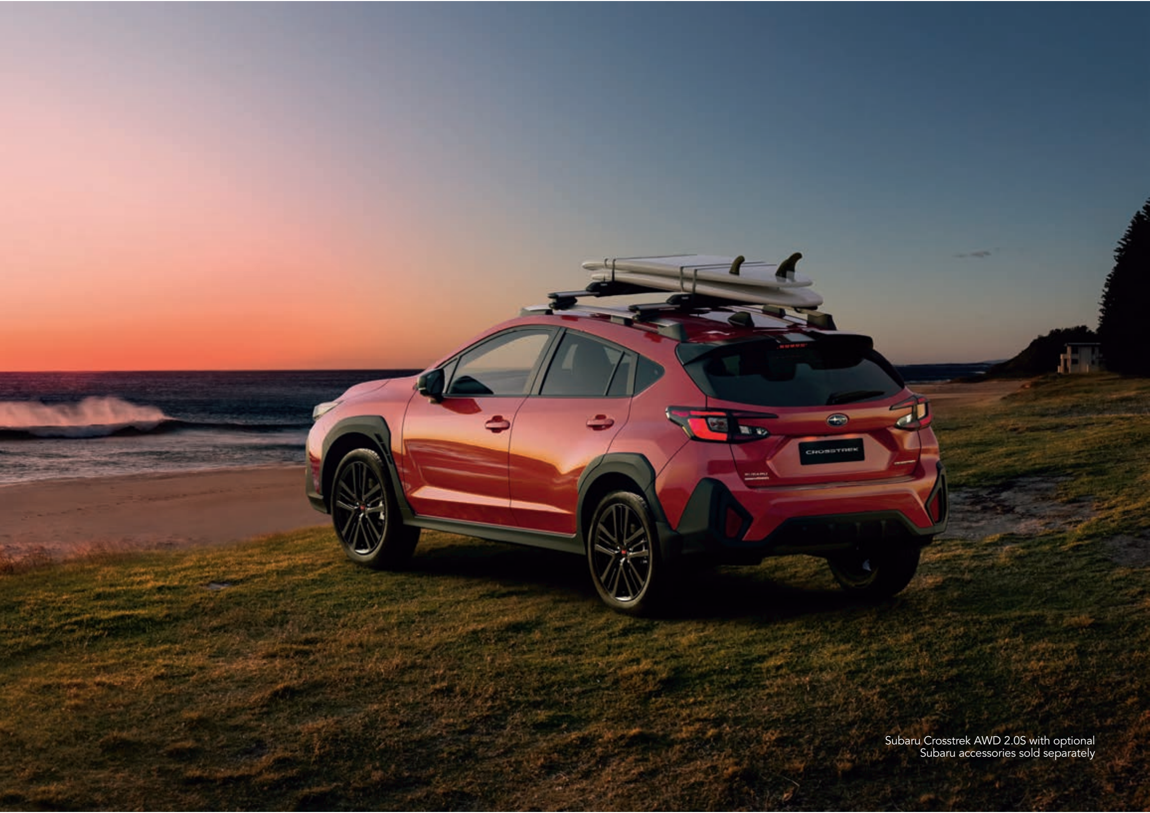
Subaru Crosstrek AWD 2.0S with optional Subaru accessories sold separately