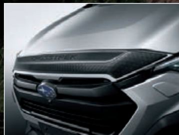
FRONT NOSE GARNISH