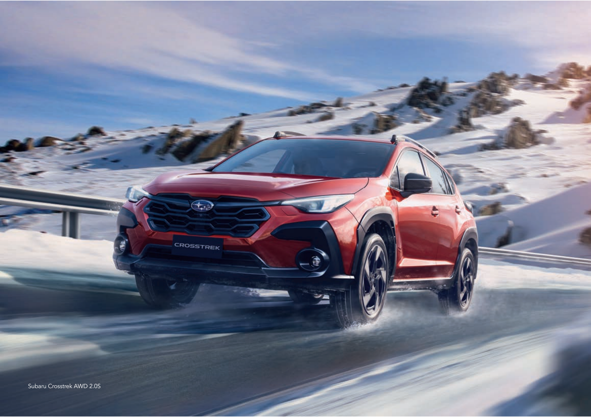
Subaru Crosstrek AWD 2.0S