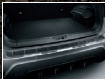
CARGO STEP PANEL (RESIN)