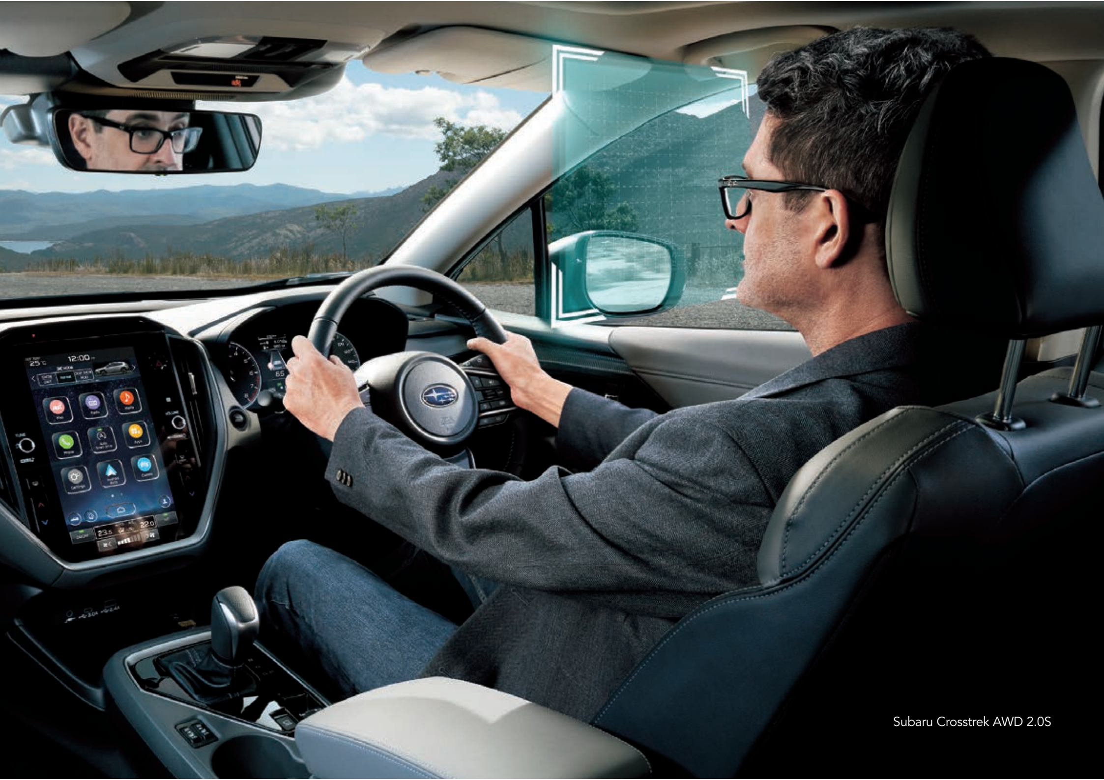
Subaru Crosstrek AWD 2.0S