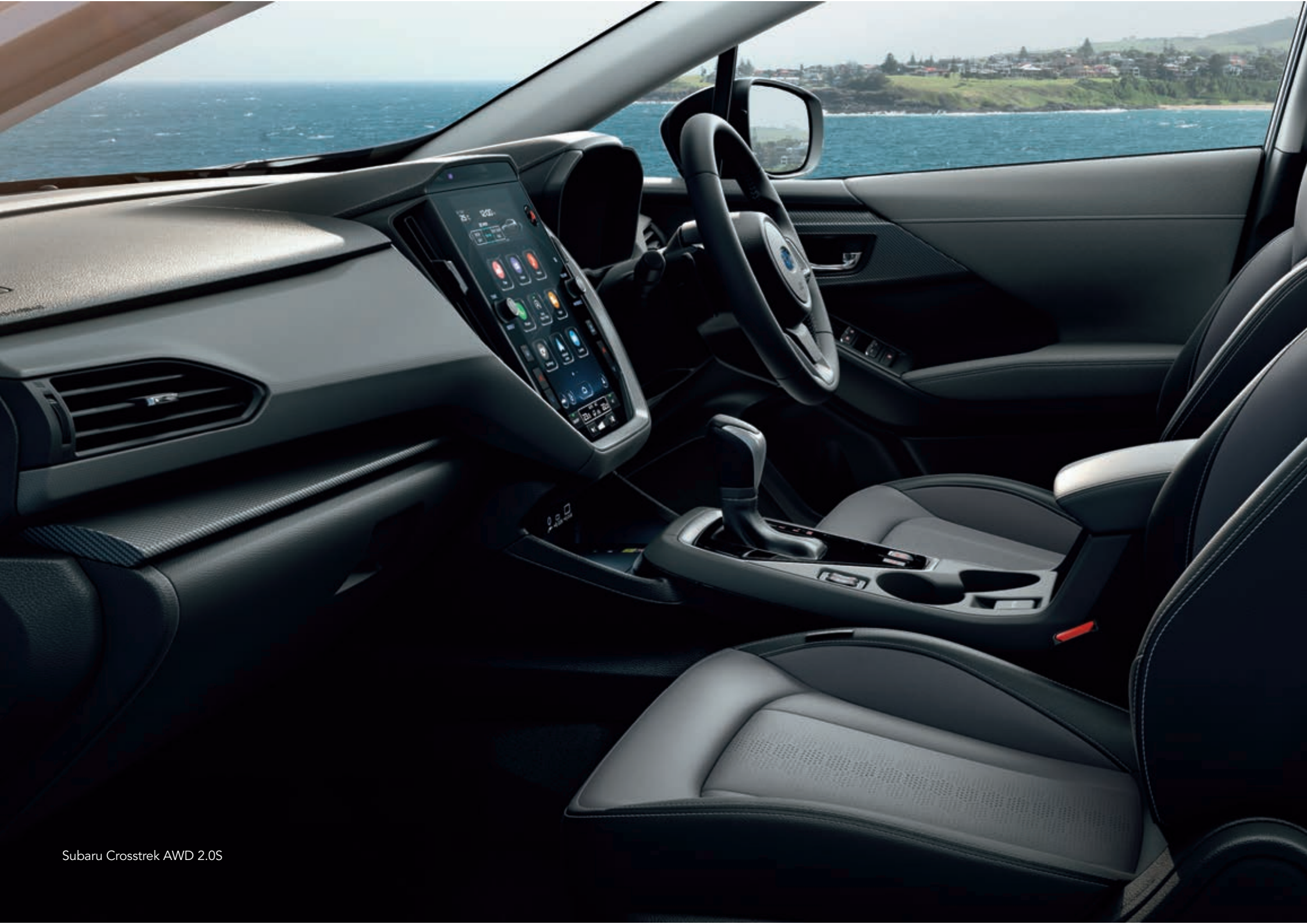
Subaru Crosstrek AWD 2.0S