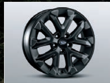
18IN RUGGED WHEEL SET (MATT BLACK)