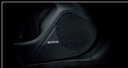
Subaru Crosstrek AWD 2.0S

Featuring the advanced, multi-function infotainment command centre, which can be controlled with the power of your voice or the flick of a finger, to select different audio options and adjust the dual zone air-conditioning.