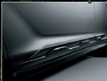
DOOR UNDER GARNISH