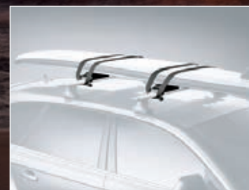
PADDLE BOARD & MAL CARRIER