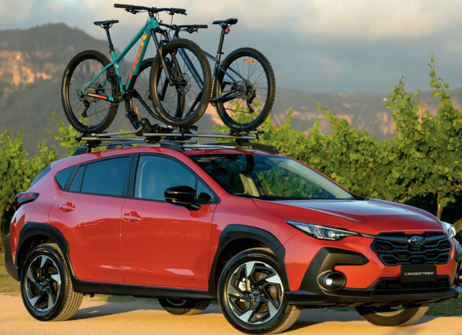
Subaru Crosstrek AWD 2.0S with optional Subaru accessories sold separately