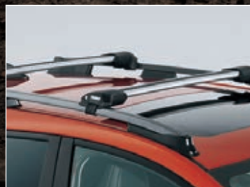
LOW PROFILE CROSS BARS