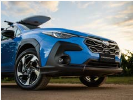
Subaru Crosstrek AWD Hybrid S

The future is now, with Subaru e-Boxer technology driving the all-new Subaru Crosstrek Hybrid variants. The dynamic plug-free hybrids seamlessly team power from a compact battery and quiet electric motor, with the petrol engine for the ultimate in driving efficiency.