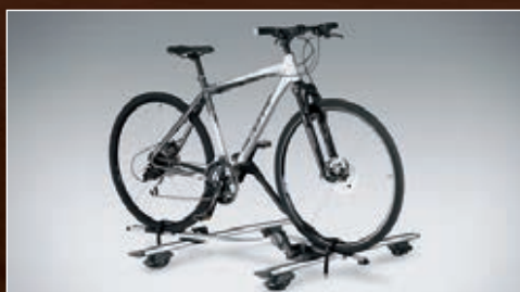
BIKE HOLDER - SILVER