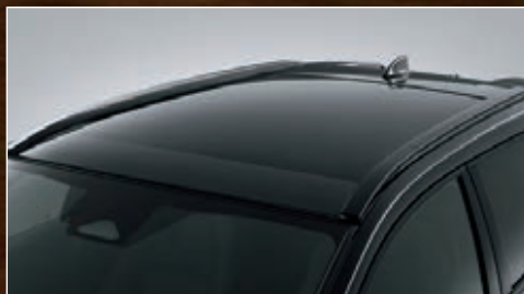
PROTECTION FILM ROOF