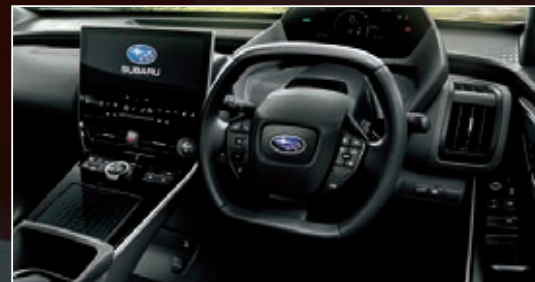
HEATED STEERING WHEEL

Premium 10 speaker Harman Kardon® 4 sound system available on the Subaru Solterra AWD Touring only.