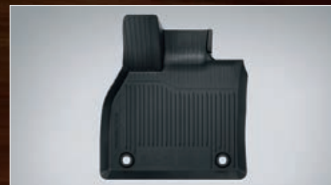
FLOOR MAT RUBBER