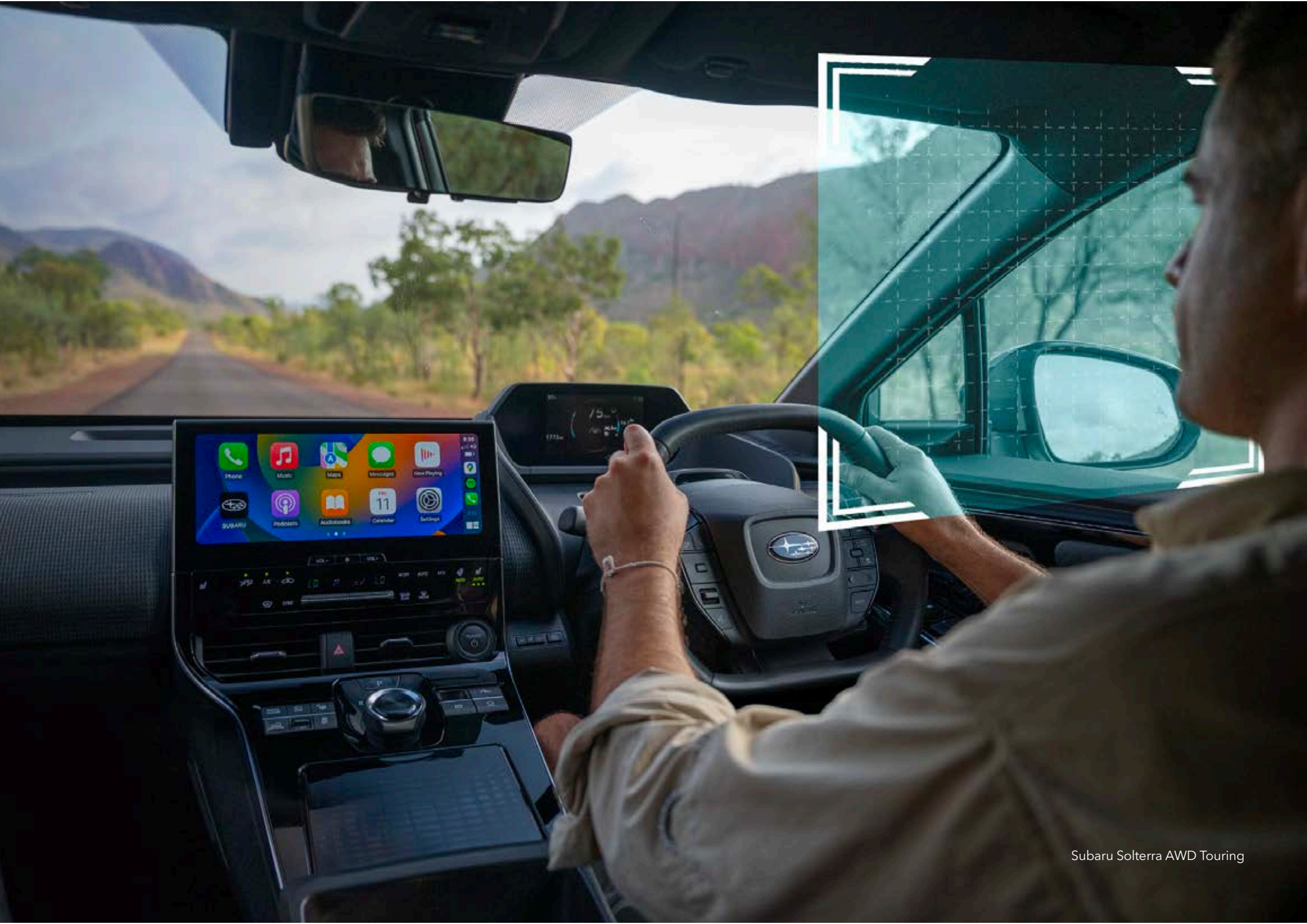
Subaru Solterra AWD Touring