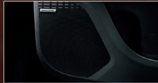
10 HARMAN KARDON® 4 SPEAKERS

Premium 10 speaker Harman Kardon® 4 sound system available on the Subaru Solterra AWD Touring only.