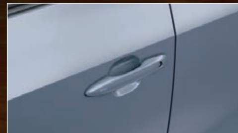
PROTECTION FILM DOOR HANDLE