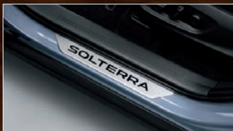
ALUMINIUM SCUFF PLATE