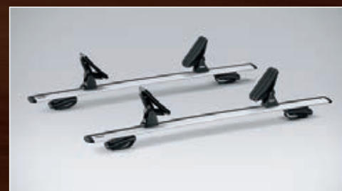
KAYAK CARRIER - DOCKGLIDE