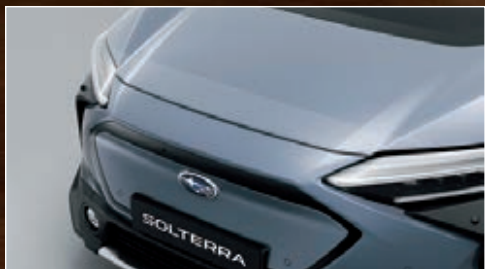
PROTECTION FILM HOOD