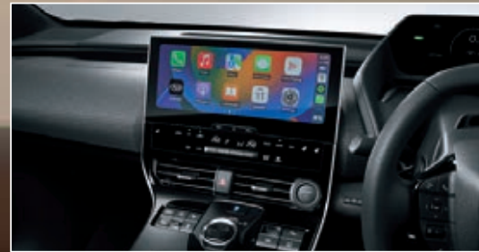
12.3" TOUCHSCREEN INFOTAINMENT SYSTEM