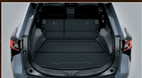
REAR BACK SEAT PROTECTOR